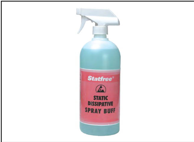
Figure 1. Statfree® Dissipative Spray Buff, ready-to-use quart spray bottle