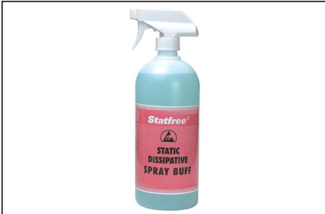
Figure 1. Statfree® Dissipative Spray Buff, ready-to-use 1 quart spray bottle