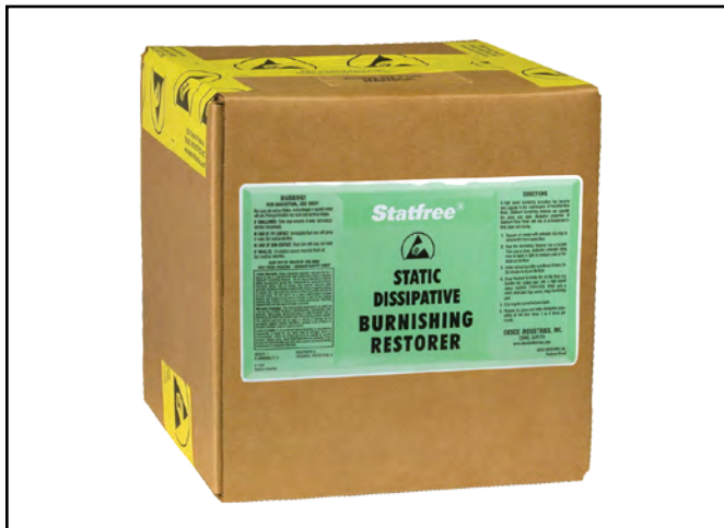
Figure 1. Statfree® Burnishing Restorer