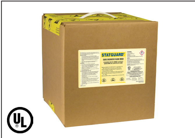
Figure 1. Statguard® Static Dissipative Floor Finish