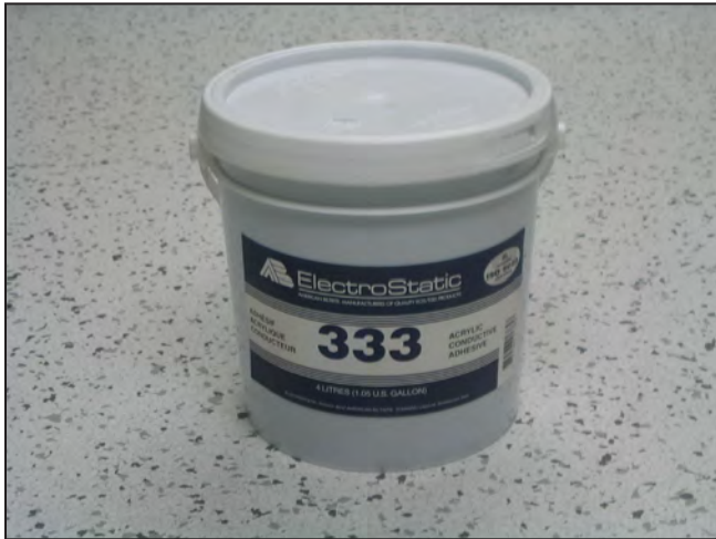
Figure 1. Statguard® One Part Acrylic ESD Vinyl Tile Adhesive